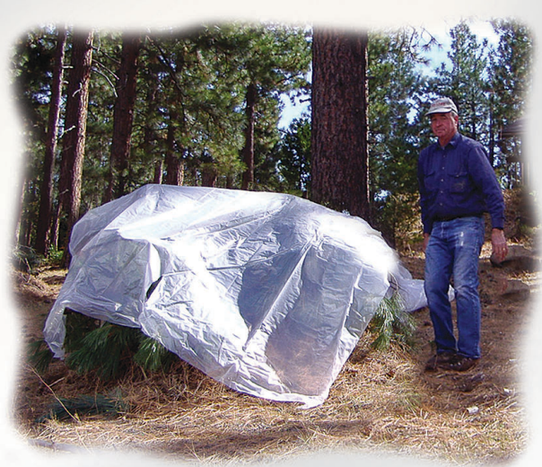
Debris burning is encouraged during the winter and spring while conditions are wet and fire danger is very low. Cover your pile with plastic to keep it dry. Then uncover it and burn when the surrounding ground is wet.