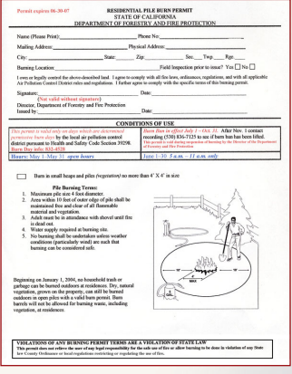
"Burn permits are free!"

✓ Residents in Butte and Yuba county should contact your local CDF station for permits.