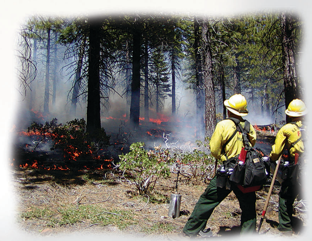
Under burning on the Plumas National Forest

We understand that our burning may be of concern to you and invite you to contact our office directly with your questions and concerns. We will also attempt to keep you updated with when and where we are burning. We look forward to working with you to protect our communities and improve the health of our forests.